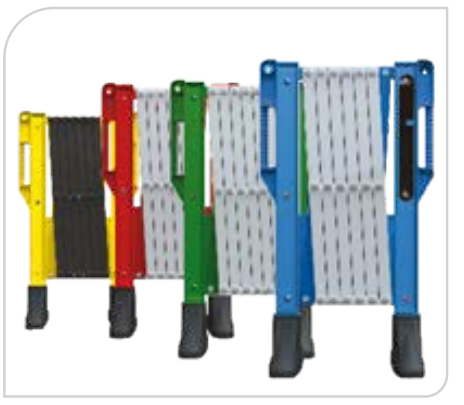
Mulitiple colour combinations available